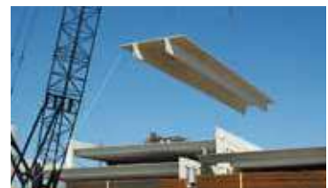
Prefabricated / Modular