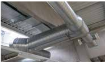
Mechanical / Plumbing