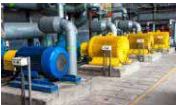
Plant / Equipment Installation